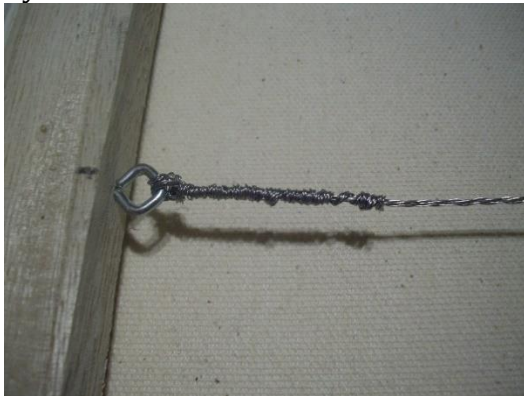
Eye Hook Inside Canvas Frame: