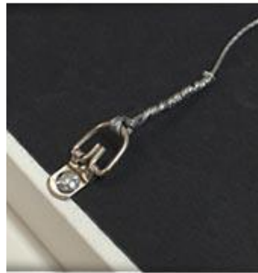
D Hook on Top/Face of Frame: