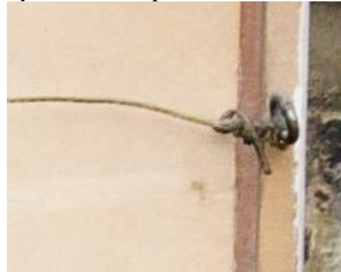
Eye Hook on Top/Face of Frame: