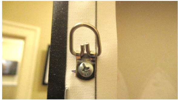
CORRECT EXAMPLE : D Hook on the back of a stretched canvas screwed into the wood on the back 1/3 of the way down from the top. Hook is pointing up.