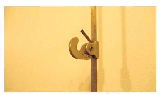
Brass & copper hook detail.