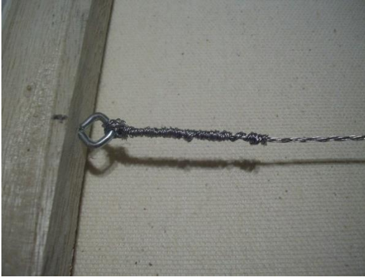
Eye Hook Inside Frame: