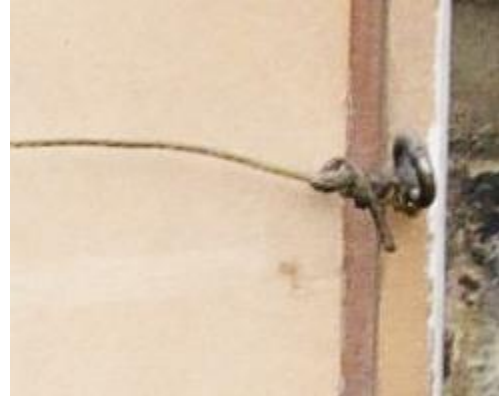
Eye Hook on Top/Face of Frame: